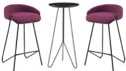
LUXE - Purple Package - $550+gst Includes black dry bar + 2 purple stools