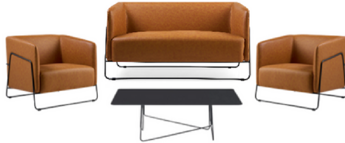
Lounge Package - $1,450+gst Includes tan double seater, 2 x tan armchairs, 1 black coffee table