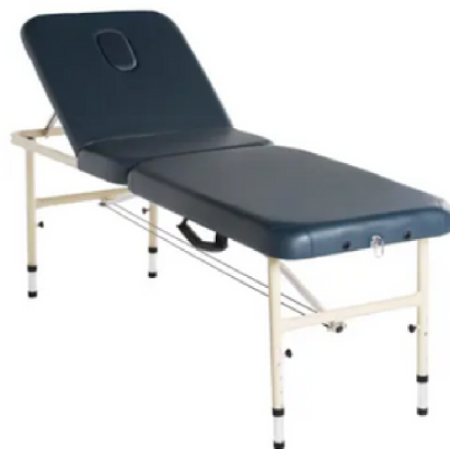
Beauty Bed Hire - $195+gst Colours may vary