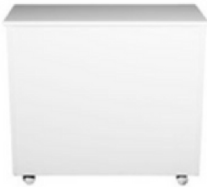
Counter white - $265+gst Open back shelving