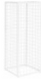
White Wire plinth 400mmW x 1200mmH - $175+gst 400mmW x 600mmH - $125+gst