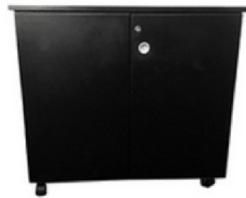
Counter black - $385+gst Lockable, with shelving