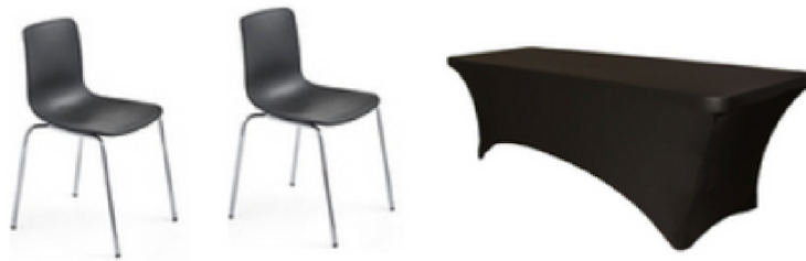
Trestle Package - $195+gst Includes 1.8m trestle, black fitted cloth, 2 black chairs.