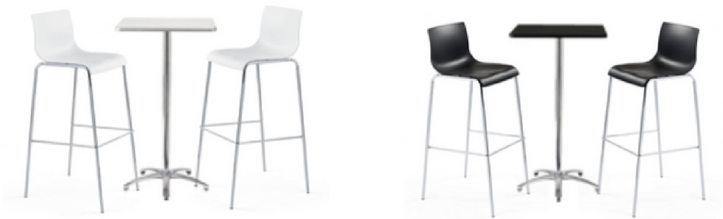
Bar Package - $370+gst Includes bar table & 2 bar chairs. Available in white & black.