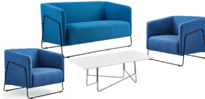
Lounge Package - $1,450+gst Includes blue double seater, 2 x blue armchairs, 1 white coffee table