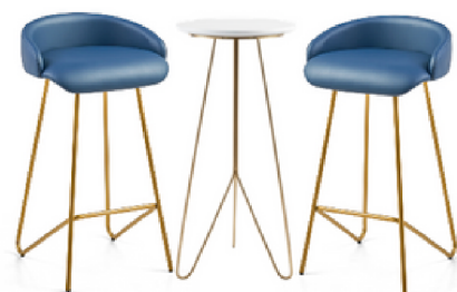
LUXE - Blue Package - $550+gst Includes white/gold dry bar + 2 blue/gold stools